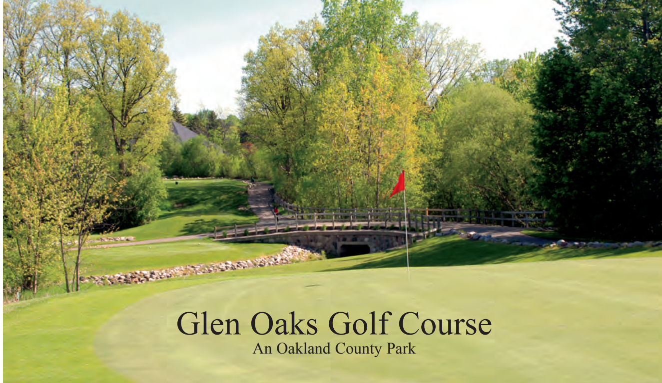
Glen Oaks Golf Course An Oakland County Park