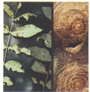
8. Cristulariella (or bull's-eye) leaf spot of walnut