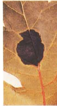
12. Tar spot of maple