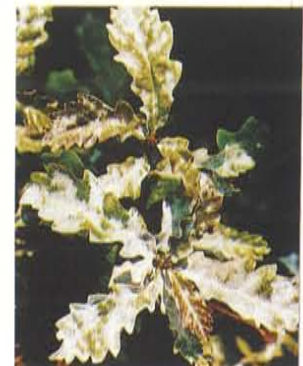
18. Oak powdery mildew