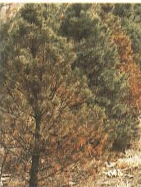
15. Lophodermium needle cast of scots pine