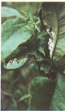
5. White mold or downy spot of walnut