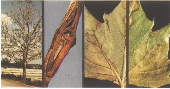
1. Sycamore anthracnose