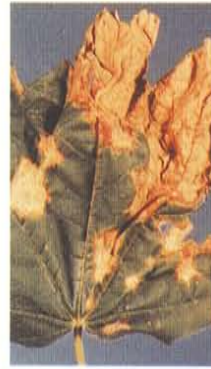
2. Maple anthracnose