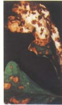
3. Anthracnose of white oak