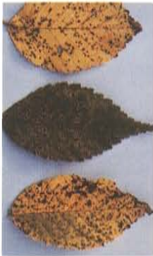
9. Black leaf spot (or anthracnose) of elm