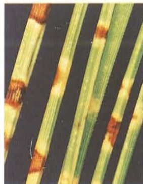
16. Brown spot needle blight