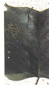
13. Aphids and sooty mold of tuliptree