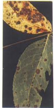
4. Walnut anthracnose