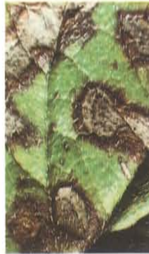
11. Hawthorn leaf blight