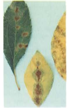
14. Crabapple scab