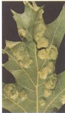
10. Oak leaf blister