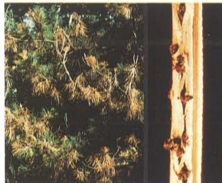
17. Diplodia tip blight on Austrian pine