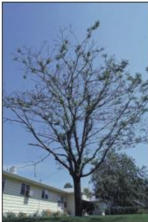
Three characteristics of this tree indicate decline: sparse foliage, leaves in tufts, and branch dieback.

The crowns of affected trees often thin out. Terminal branch growth becomes limited, and branches may die, beginning at the top of the tree and progressing downward. Leaf scorch (the browning of leaf edges) frequently accompanies the syndrome, too. However, leaf scorch symptoms can result from minor problems, as when the tree loses more water than its roots can take up.