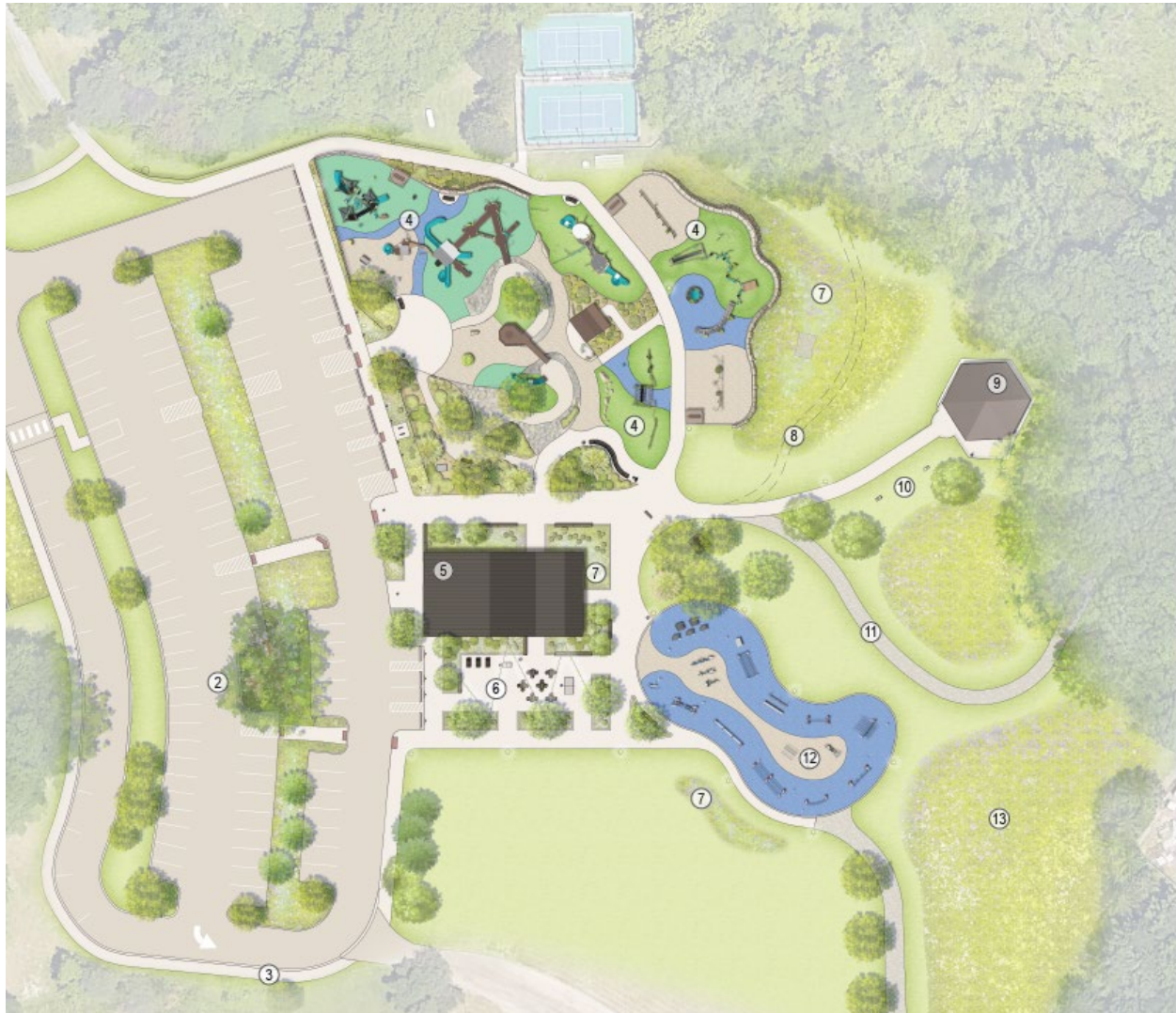
Figure: Waterford Oaks Renovation Master Plan