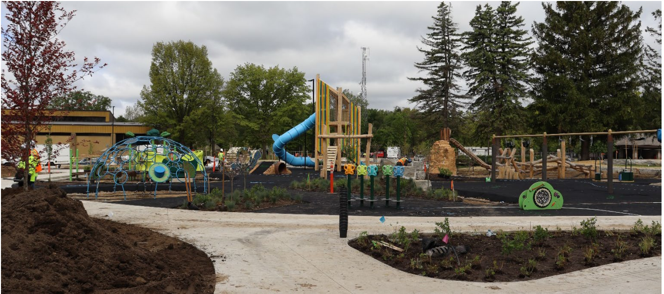
Figure: City of Southfield Beech Woods Park playground