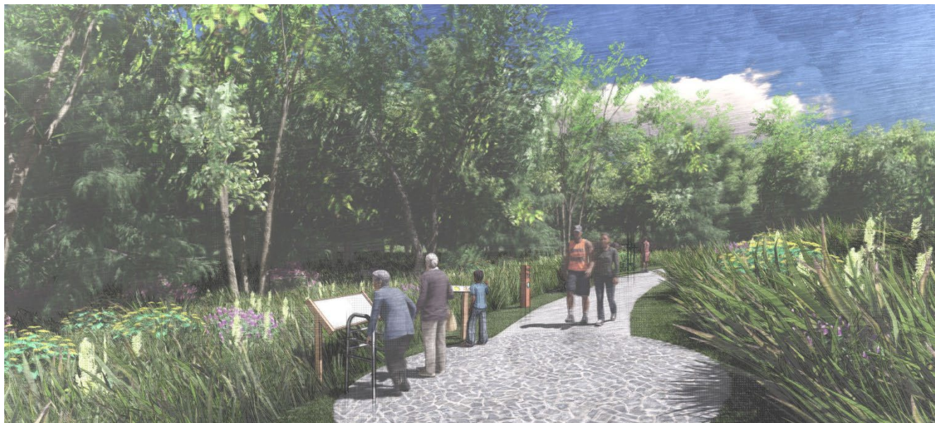
Figure: Southfield Oaks concept sketch