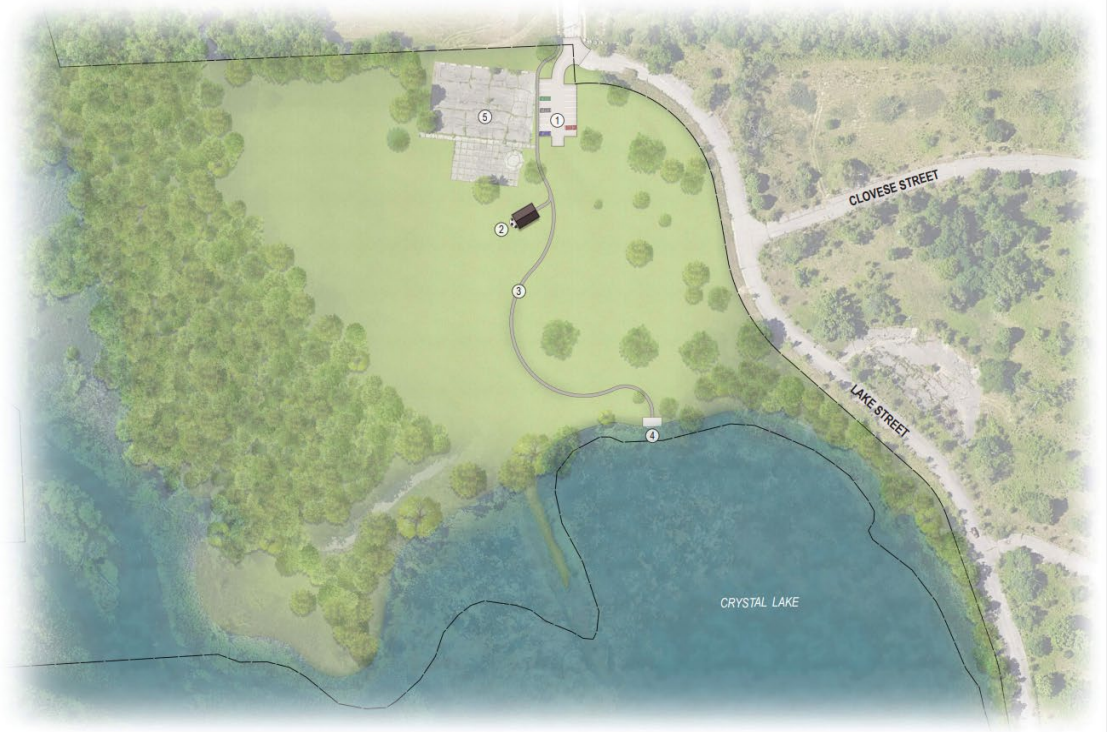
Photo: first phase master plan for Crystal Lake Park in Pontiac