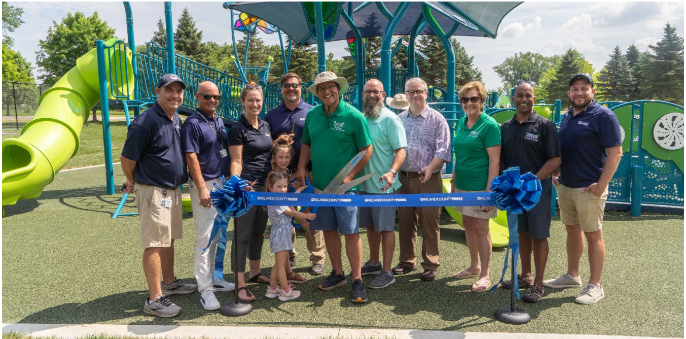
Photo: Grand Opening at inclusive playground at Lyon Oaks County Park on June 22, 2024