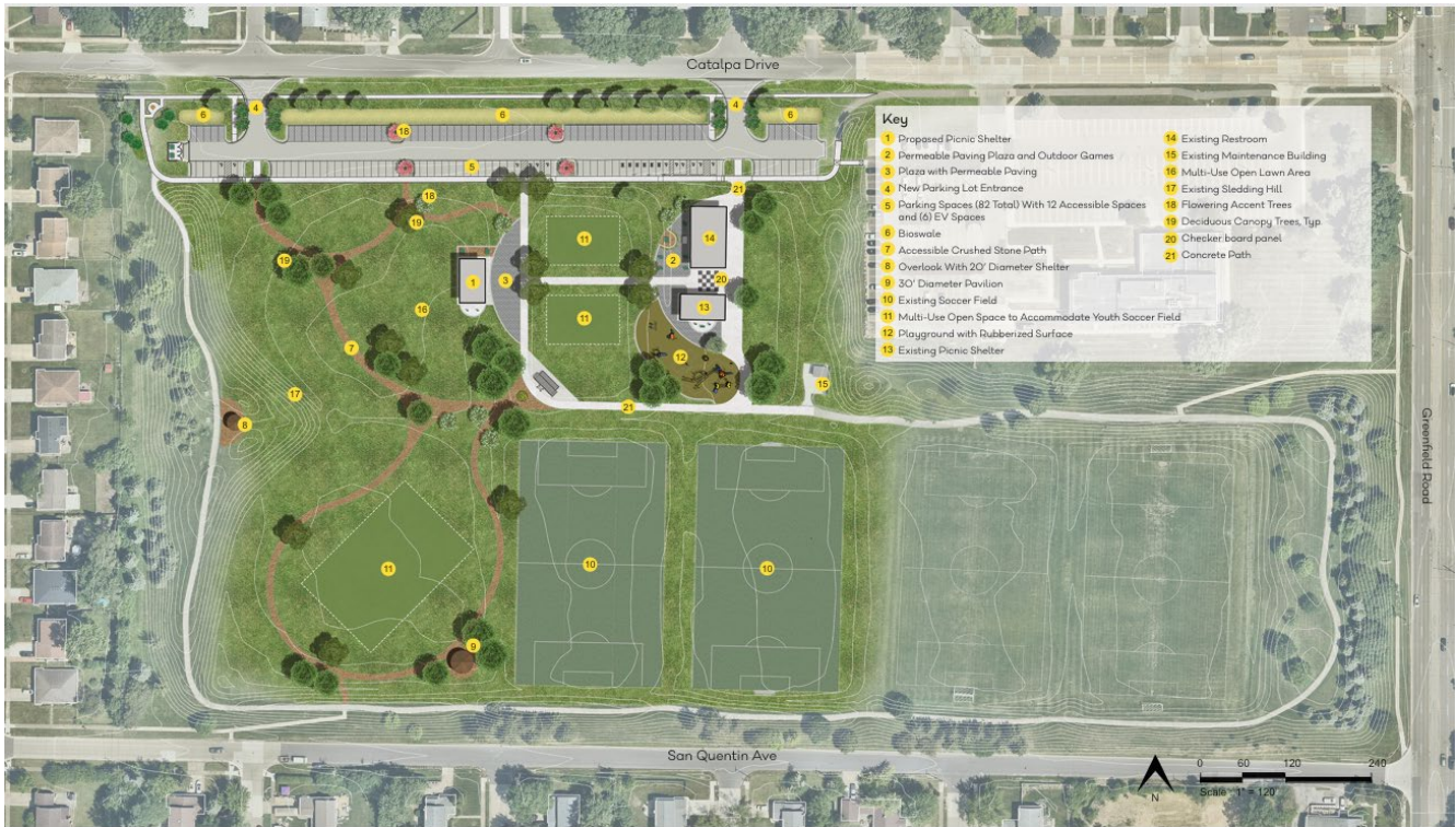
Figure: Schematic master plan for Catalpa Oaks