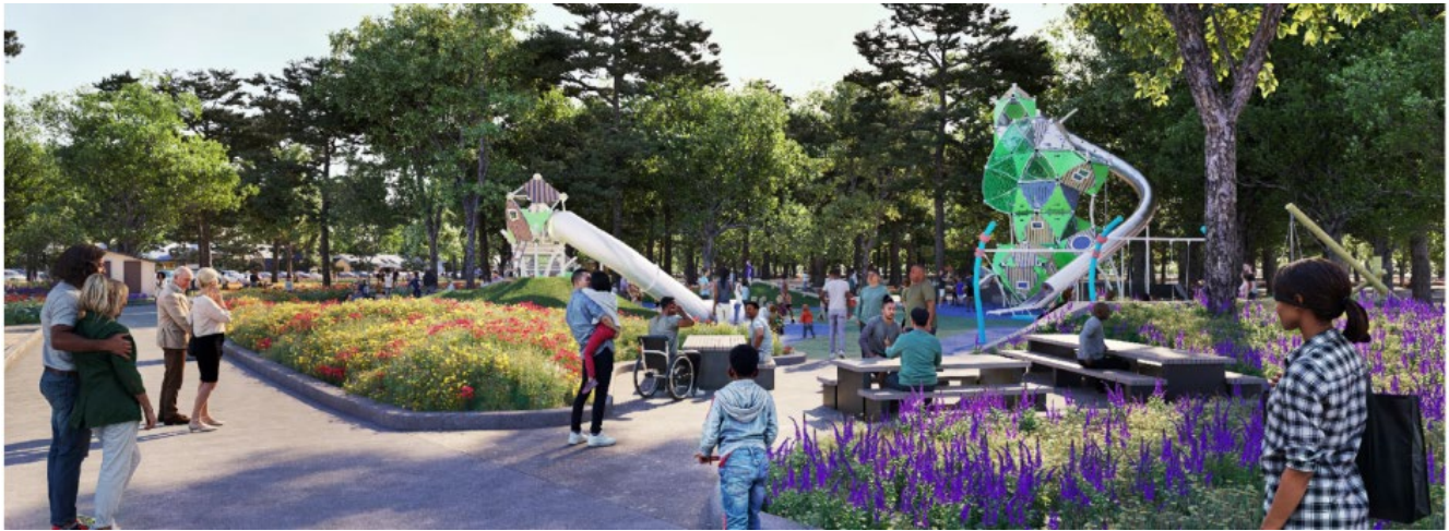
Figure: Rendering of the future Oak Park Woods at Shepherd Park