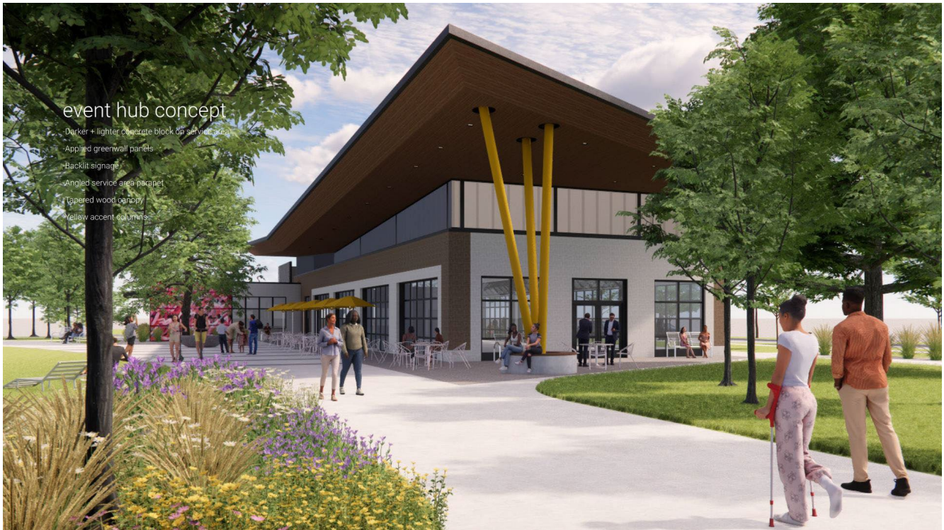
Figure: Oak Park Event Hub Farmers Market exterior rendering; below: floor plan