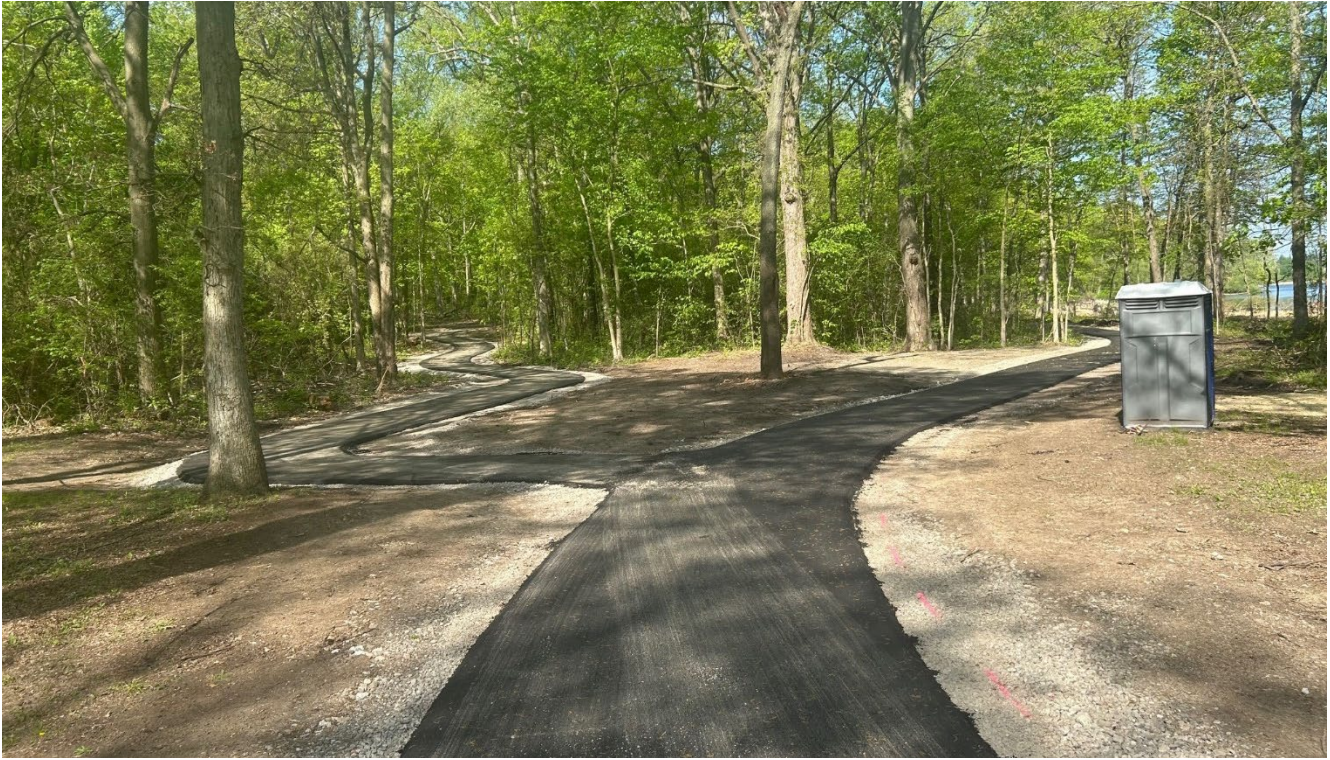
Photo: new paved trails at Pontiac Oaks County Park