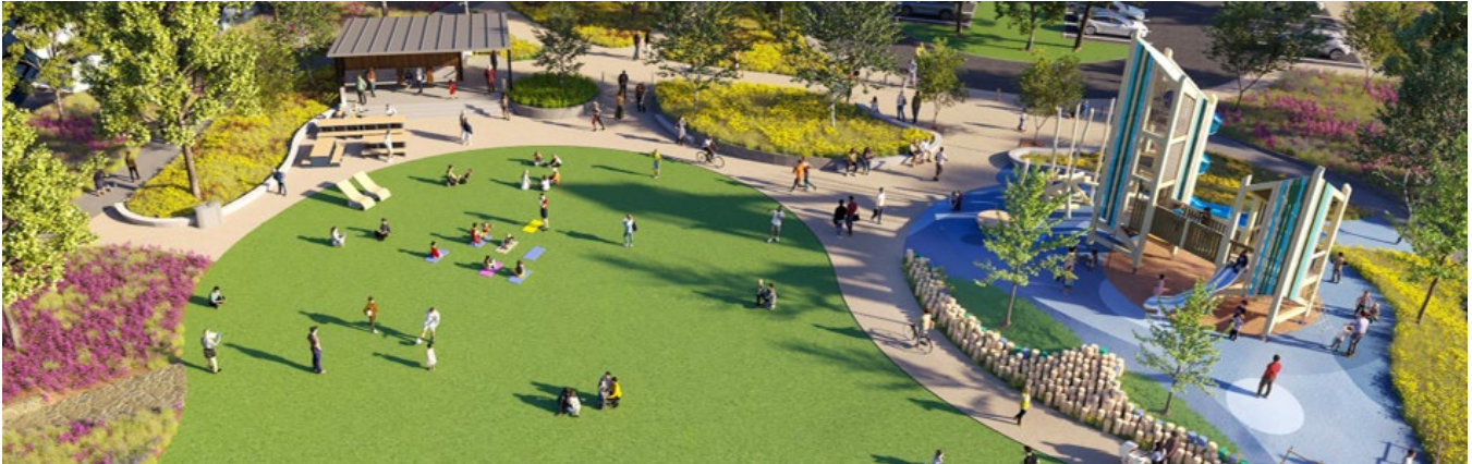
Figure: Red Oaks Play Garden rendering