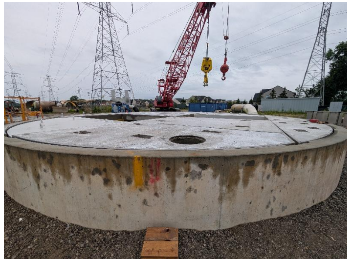
CS-12 roof panels in place