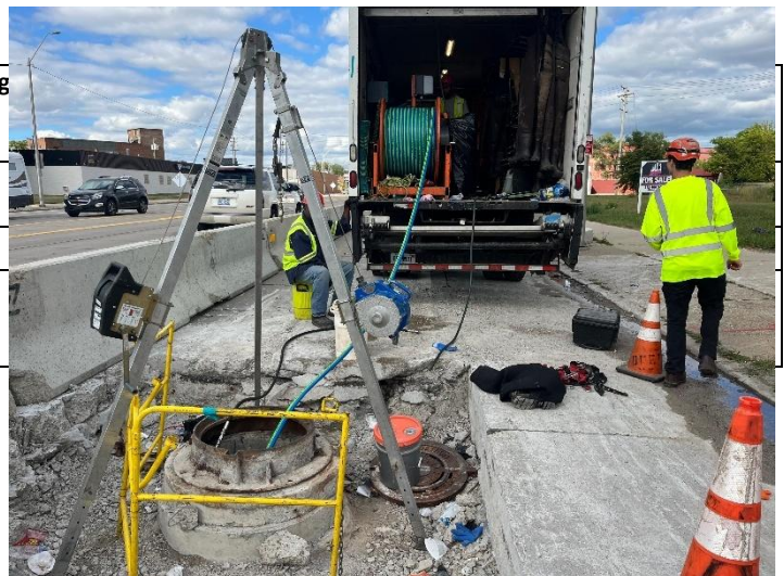
Topside chemical grouting operations