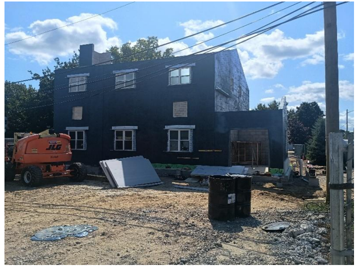
Construction of Replica House CMU walls at ST-S-3 Site (Dodge Park/Sorrento). (L: looking north, R: looking south)

SRF Segment 2 (Contract 3) Status: Complete