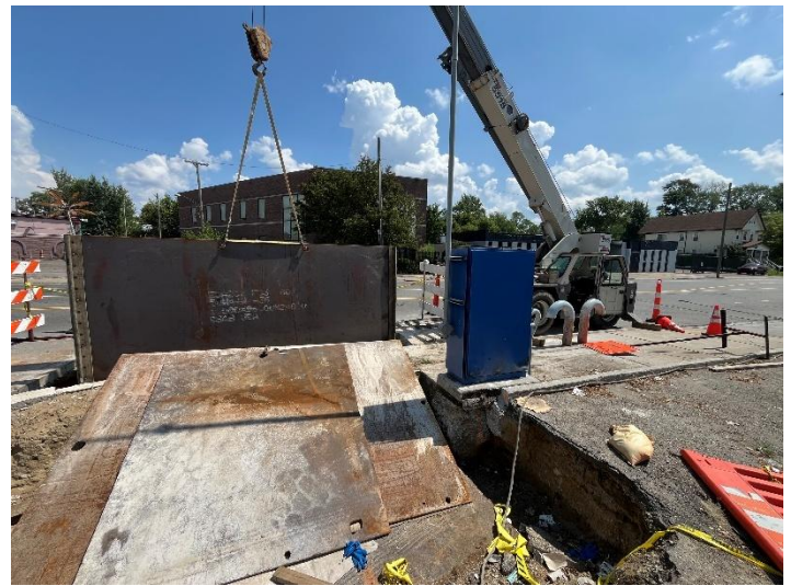
Gasketed stop plates at Mount Elliott