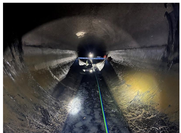
Crack repairs in PCI-19