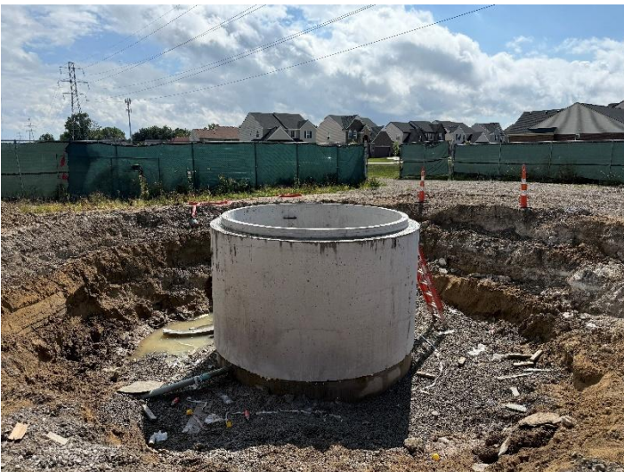
CS-4 riser in place

Aluminum and concrete roof panels have been installed in CS-12, along with handrails. The new riser and flat top has been installed at CS-4 and epoxy spraylining has been applied, with minor touch-ups underway.