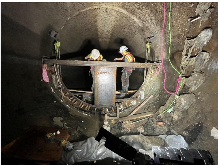
Installation of partial bulkhead near PCI-19-101