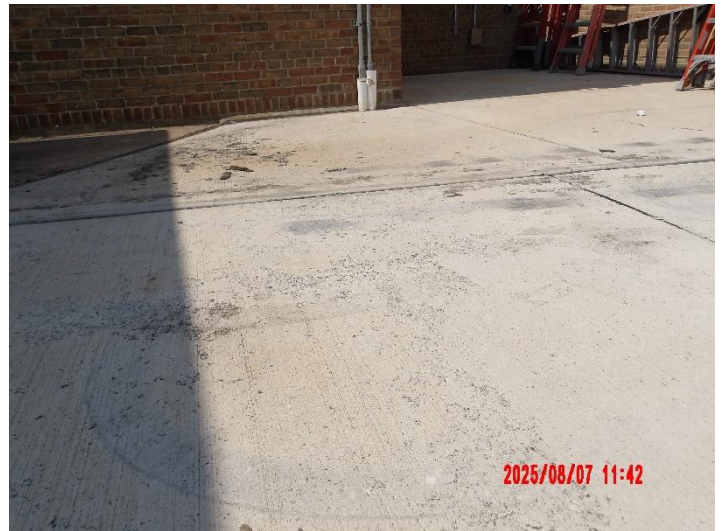
Scaled concrete near wet well mechanical room