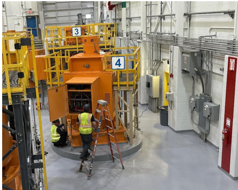
Pump 4 isolation