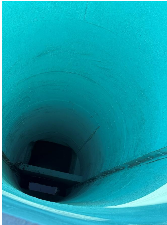
CS-4 epoxy spray lining