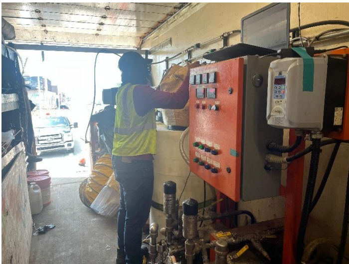
Chemical grout mixing