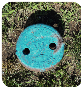
Curb Stop Lid

A curb stop lid is a four-inch round metal cover over the valve that controls the flow of water into the property.