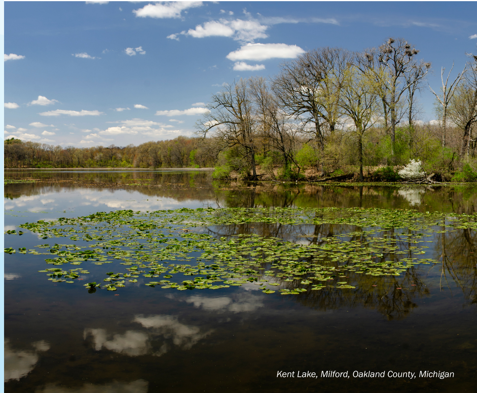
Kent Lake, Milford, Oakland County, Michigan