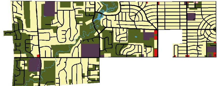
Land Use by Area