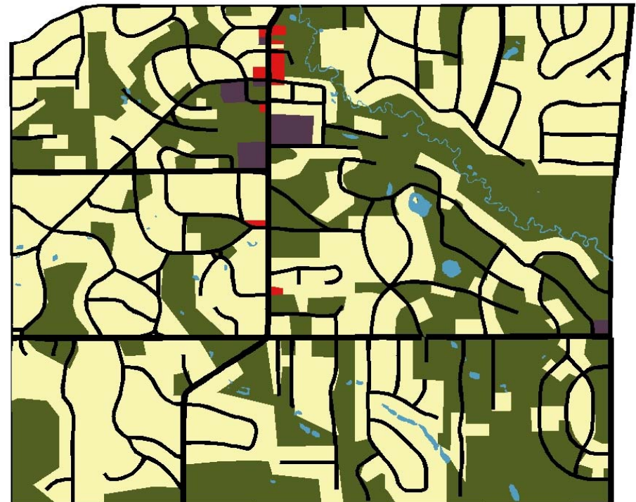
Land Use by Area