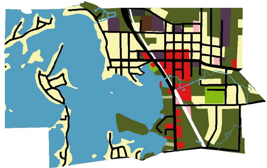
Land Use by Area