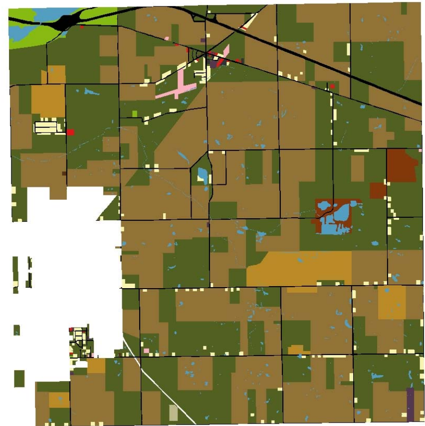
Land Use by Area