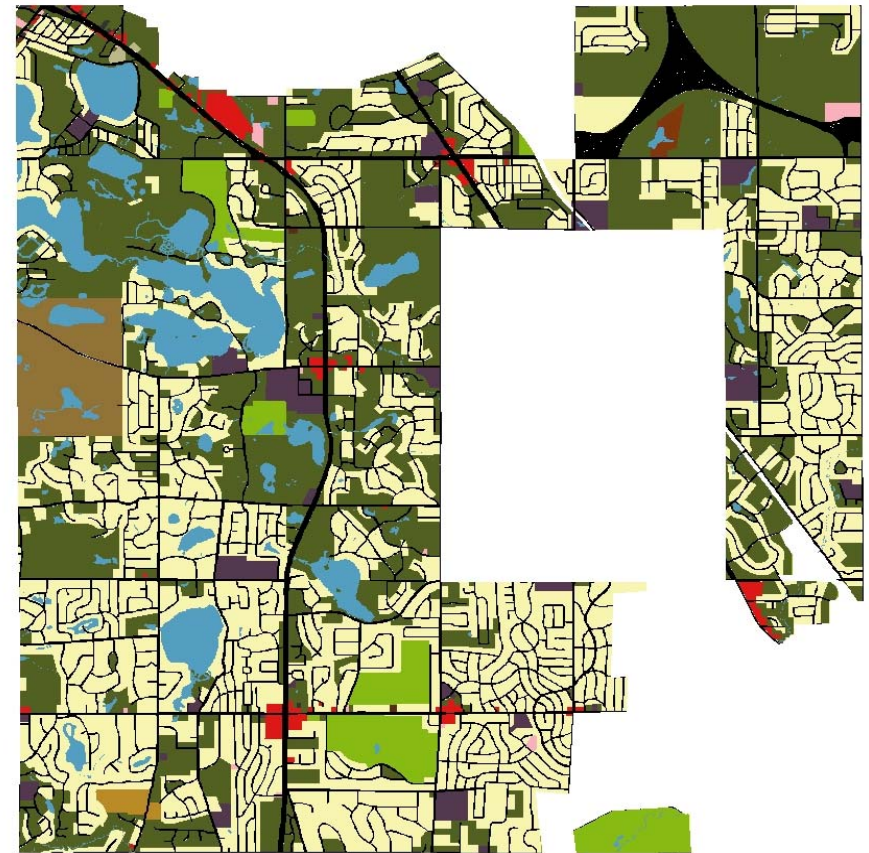
Land Use by Area