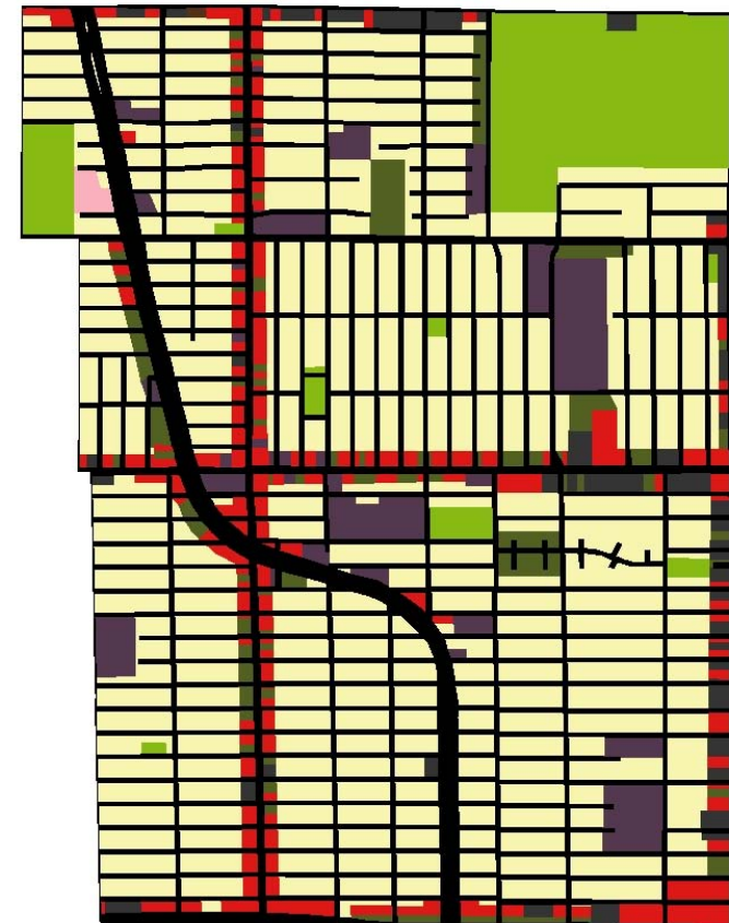
Land Use by Area