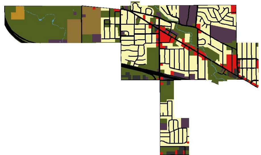
Land Use by Area