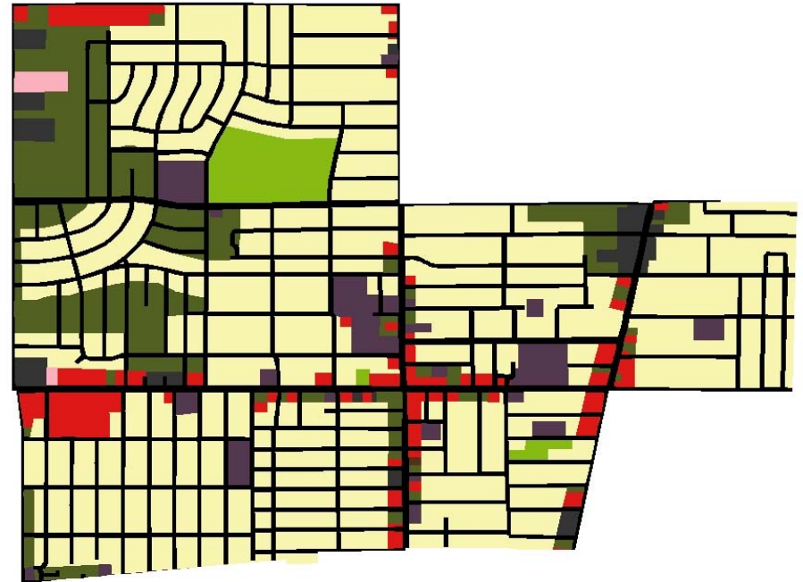
Land Use by Area