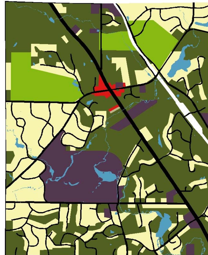
Land Use by Area