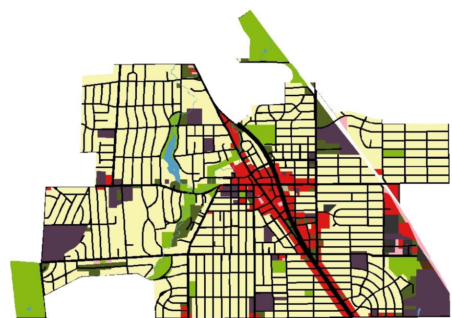
Land Use by Area