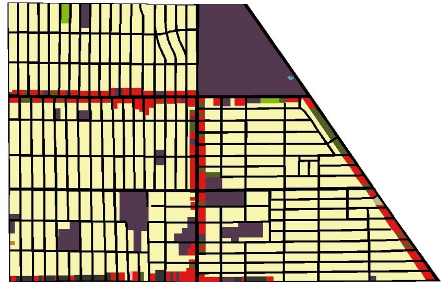
Land Use by Area