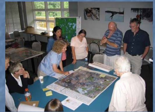
OC NAG members discuss the County's remaining natural areas