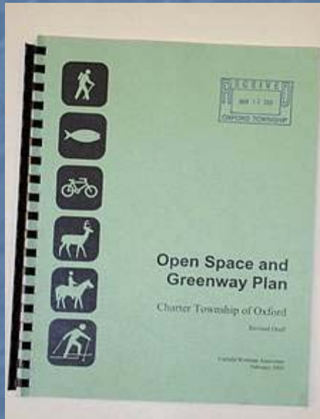
Oakland Township's Open Space & Greenway Plan

While there are many ways to approach conservation of Green Infrastructure, the most effective way is to update local comprehensive plans, codes, and ordinances to reflect the community's commitment to conservation.