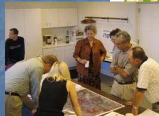
Orion township completes their GI mapping charrette