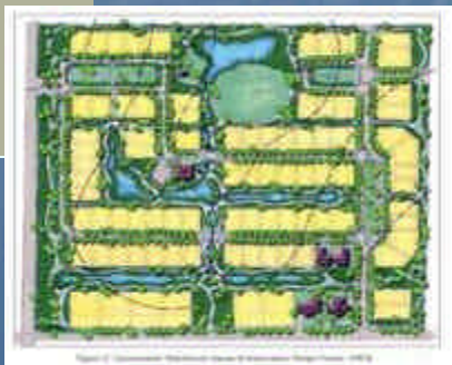
Conservation Design for Stormwater Conveyance