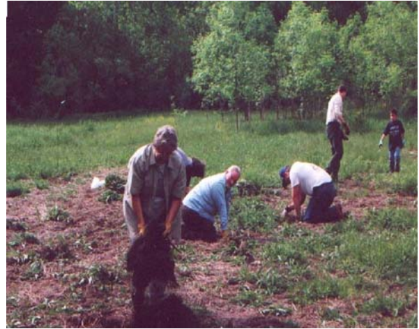
Volunteers assist in constructing the Prairie garden.

The project was initiated to demonstrate how a partnership between local government, citizens, and non-profit organizations can successfully restore native ecosystems on the landscape. This piece of land behind the Rochester Hills Environmental Education Center was infested with invasive species such as spotted knapweed. Volunteers worked to killoff the invasive plants by covering the ground with newspaper and plastic sheeting. The volunteers then installed native plants. The prairie is weeded every year to remove invasives. To assist on a work day, please contact Oakland Land Conservancy at the above number.