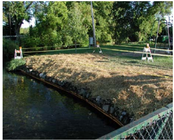
Completed lunger structure in Children's Park, downtown Lake Orion, on Paint Creek a tributary to the Clinton River.