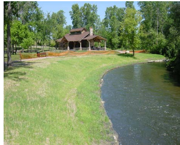
One month after completion.

The project involved the stabilization and restoration of a river bank, soil bioengineering with live staking, native wildflowers, grasses and trees, and 20 luncker structures (total of 160 feet). The project also included creation of additional fish habitat along a 1,400 foot stretch of the Clinton River. Improvements were accomplished through the use of eight boulder clusters and eight pool enchantments (woody debris).